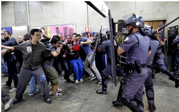
Metro workers on strike clash with the São Paulo State Police