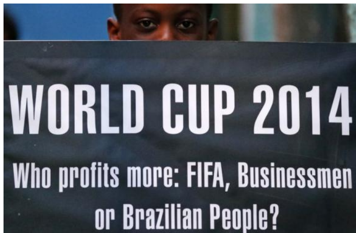
Anti-2014 FIFA World Cup Brazil™ protest signage