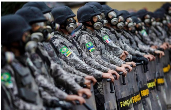
Riot police gear outside Maracana stadium in Rio de Janeiro, Brazil

Risks Caused by Riot Police: The riot police in Brazil do not use a "soft response" towards protestors; they use 36-inch wood riot batons, 12-gauge shotguns loaded with M1013 less-than-lethal munitions, .23 caliber hard rubber pellets, flash-bang grenades and CS spray all of which can cause serious injury or death. The riot police are equipped with Flex-Cuffs, Helmets with face shields, Groin protectors, Flak vests, Elbow pads, Leather gloves, Shin protectors, lethal and less-than-lethal weapons. Keep at least a five mile radius away from any protest sites.